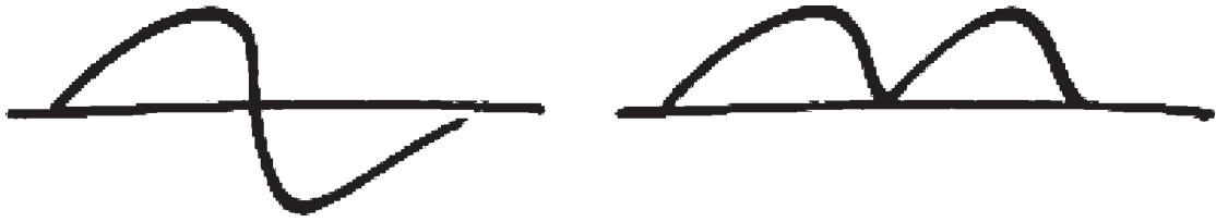
Figure 6. Sinus curve, with flipped negative segment, which leads to a 'metallisation' of the sound.

This results in many irregularities, fractures and bends in the course of the vibration, which result in a large number of non-harmonic overtones characteristic of metallic sounds. When the relationship among the several initial pitches is neither even numbered nor based on any other simple pitch relationship, but instead is – shall we say – made somewhat chaotic, as in the sculpture's factor, then the sound is additionally distorted. In a way the metallised sound goes 'rusty'. Even I cannot predict what the exact result will sound like, since a small change in the frequency – triggered by a visitor – can set off a major transformation in the sound. This is the exciting aspect, but also the risk which I take by employing this open concept. In spite of the metallisation and the unpredictable changes in sound, the articulated semitones remain perceivable. The type of articulation is influenced by a noise dependent on the daylight which modulates the sinus tones. 'Day/night – disquiet' is what I call it. Moreover, the sampled traffic noise from the environment also transforms the sound via the sensors into a noise, which at times can hardly be distinguished from the surrounding traffic noises.