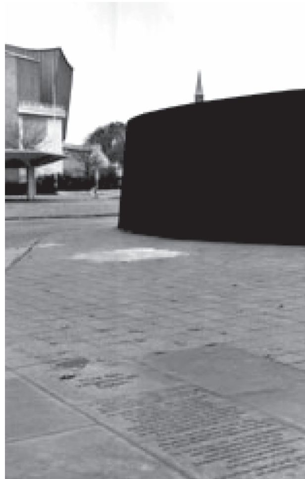
Figure 9. Memorial plaque in the ground beside the sculpture.

Serra himself gave the sculpture, without knowing the history of the site, the title 'Berlin Junction', leading to my second political aspect. I read his sculpture as a commentary on Berlin's situation before the fall of the Wall, during which the two halves of the city,