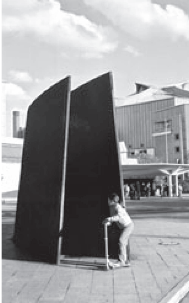
Figure 10. A child passing through the sculpture with concert visitors in the back at the entrance of the Philharmonie concert hall.

the West and East blocks, the two political systems, stood threateningly against one another and kept themselves in a precarious balance, constantly in danger of falling into themselves. I emphasise with my work the possibility of passage, of transition, which is embodied in Serra's work as a spatial situation, and fuse it with a continuous musical process, as described above. This transformation through movement, in other words, is that which after the Wall's fall in 1989 mentally and physically became reality.