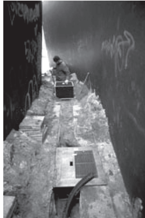
Figure 5. Installation works in March 2001.

the relationship between the radii of the focal points of both of Serra's 'curves'. Expressed in figures this results in the factor of 1.052598 – which almost corresponds exactly to a semitone. Serra's plates are thus a semitone distant from one another, and in my fundamental sound one can always perceive an articulation of two pairs of pitches with this distance. This leads to a first relationship of tension, in which a similar relation between proximity and distance exists as between Serra's plates. Naturally I exploited the possibilities of the computer and employed not the factor for a semitone – 1.059 – but instead the sculpture's exact factor. This is then important because for the next transformation process consequences arise, which I call 'metallisation of sound', an aspect which can be reinforced or reduced by the visitors via one of the sensors.