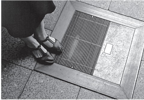
Figure 2. One of four ground grids with a loudspeaker and a light underneath the ground on the left side and two infrared distance sensors at the right side covered by a little window. Each loudspeaker cavity contains two sensors aimed in different directions.