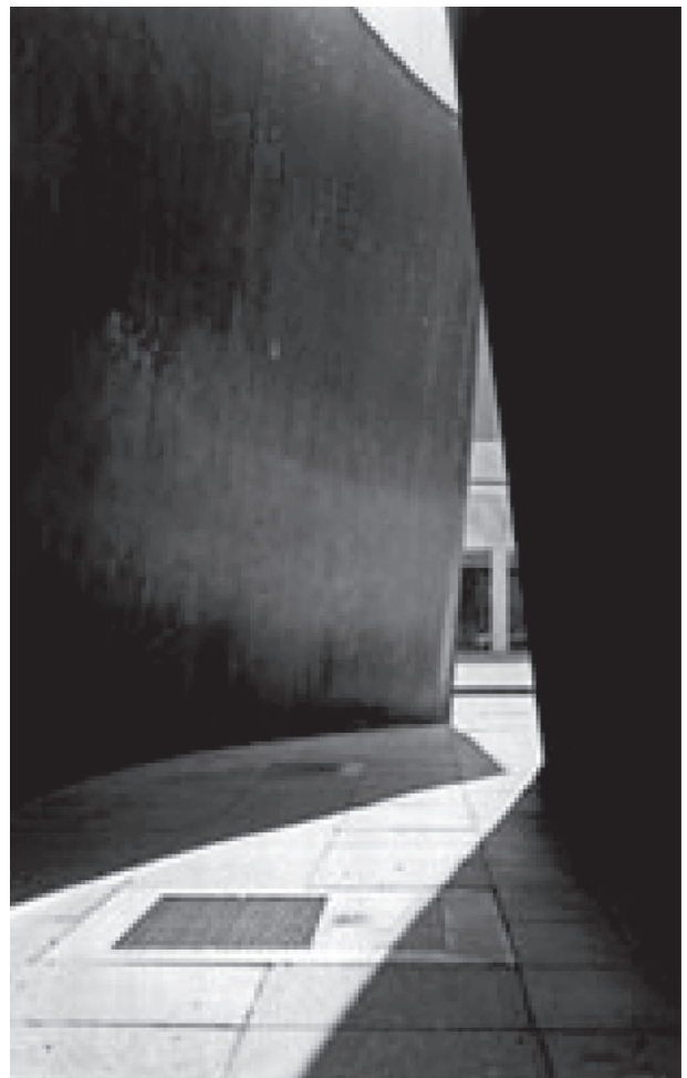
Figure 8. Curves of shadow in the sculpture.