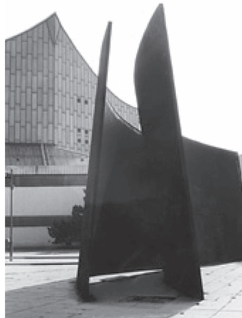
Figure 1. 'Berlin Junction' sculpture (1987) by Richard Serra before the Berlin Philharmonie Concert Hall by Hans Scharoun, with ground grids from the installation transition in the gap between the plates (2001).

In Serra's 'Berlin Junction' work, transition emphasises the moment of passage. Transformation through movement is the concept. In the sculpture a fundamental sound is permanently induced by six computer-based sinus generators. Only when a visitor moves through the sculpture does this static sound begin to move and is gradually changed. Infrared sensors in the ground measure the distance to the visitors, so that their movements are fed into and processed by the computer system in the Philharmonie's foyer. Over time visitors cause the sound to change day and night. Listeners transform what they hear. The visitors become players in a musical process lasting months. The sculpture becomes an instrument.