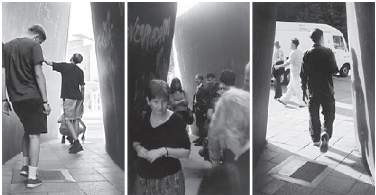
Figure 3. Visitors to the installation in the gap between the sculpture's plates playing with the sensors or just walking through the sound situation .

For the musical realisation this means that the acoustic events in the sculpture do not consist of a pre-fabricated endless loop, but instead a compositional process using a musical automaton: a computer with the Max/MSP software. For the initial material I employ, aside from the sinus generators, three samples: sixteen seconds of traffic noise, recorded at the site, the poem 'Changing Wheels', from Bertolt Brecht's Buckow Elegies , eighteen seconds, and the word 'Hier' [here] in two versions, two seconds – a total of four different sound sources, four voices. The form in which these voices then appear, contrast and weave into one another in time and in sound is continuously variable and can be changed via the sensors. With the help of the computer the sound is