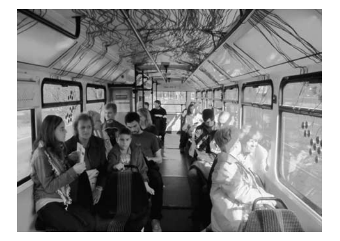
Figure 3. meta.stases (meta.stasen) : sound/light-installation in a tram car. Vehicle noises are recorded in the engine room of an old Tatra tram and played back live and transformed in the passenger compartment along with loudspeaker announcements. Please imagine intense purple light inside. European Centre of Arts Hellerau, Dresden, 2007.

In particular, appropriation by the capitalist economy aims at doing away with open, public spaces, which are transformed into 'mere passageways, mere access to places for consumption and leisure activities' (Sanio 2006: 9). 'Art in public spaces' has long been part of this appropriation when it refers to urban sculptural furnishings or acoustic ornamental art. Emphasising the freedom of this space and making people aware that it is decreasing and being violated is the challenge of artistic work,