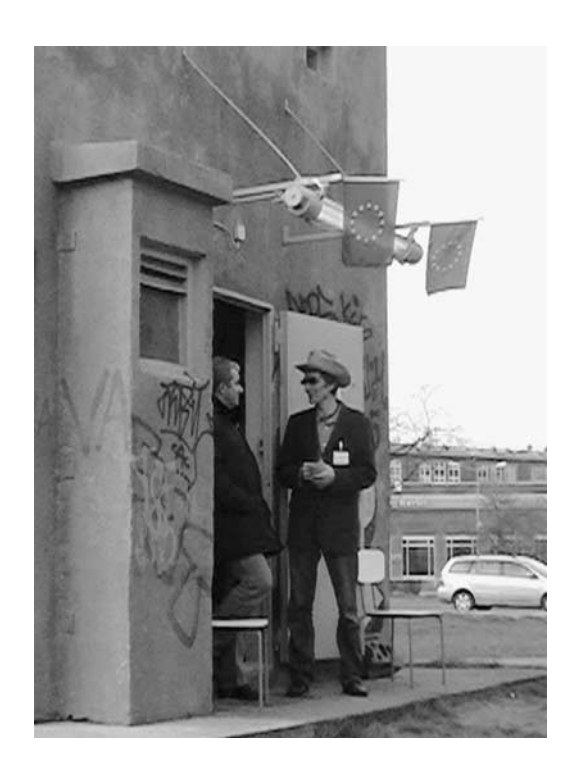
Figure 6. Entrance situation with EU flags and EUBW guiding staff.

on the ground floor; blue EU flags at the entrance create an 'official' atmosphere. The EUBW's visual showroom, with a camp bed and an old telephone, is situated on the first floor, and the second floor houses the acoustic control room, in which the interactive surveillance equipment is mounted.