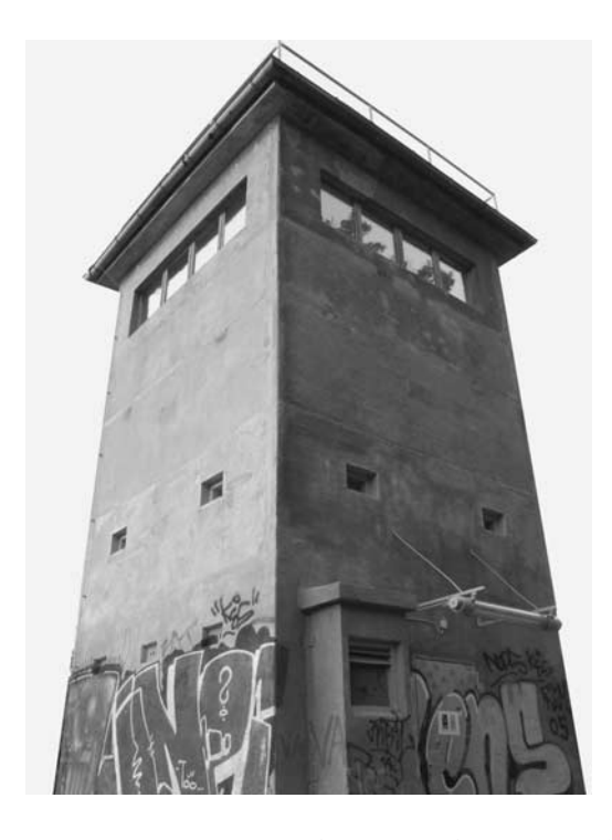
Figure 5. East German watch tower at the Berlin Wall.