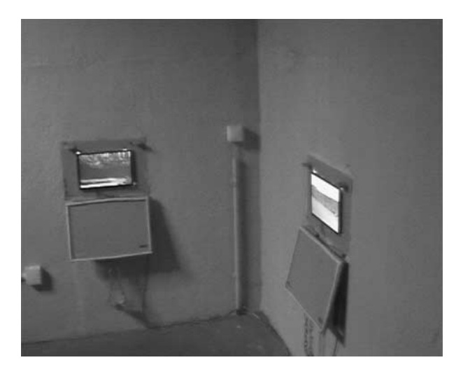
Figure 7. towersounds.2: Watch Tower (turmlaute.2: Wachturm), first floor with video screens installed in embrasures and hidden speakers.

on the ground floor; blue EU flags at the entrance create an 'official' atmosphere. The EUBW's visual showroom, with a camp bed and an old telephone, is situated on the first floor, and the second floor houses the acoustic control room, in which the interactive surveillance equipment is mounted.