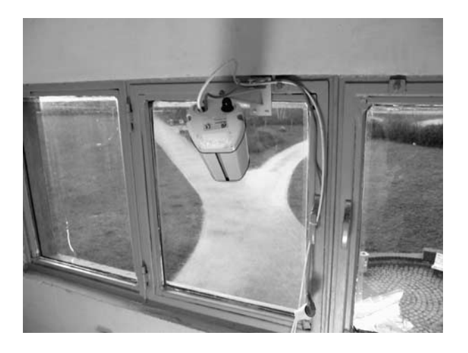
Figure 10. Video camera for observing the park paths and interactive play of the surveillant voice. Please imagine intense green light.

If a passer-by crosses the middle surveillance zone, a voice also emerges from the horn loudspeaker hanging at head level in the centre. The various snippets of sentences come from an interview with a border guard who did his military service in this tower in GDR times and, over 18 years later, recounts how they worked and what unusual events occurred ('... yes, definitely', '... so what we made, they were such wires, they were self-firing devices, but