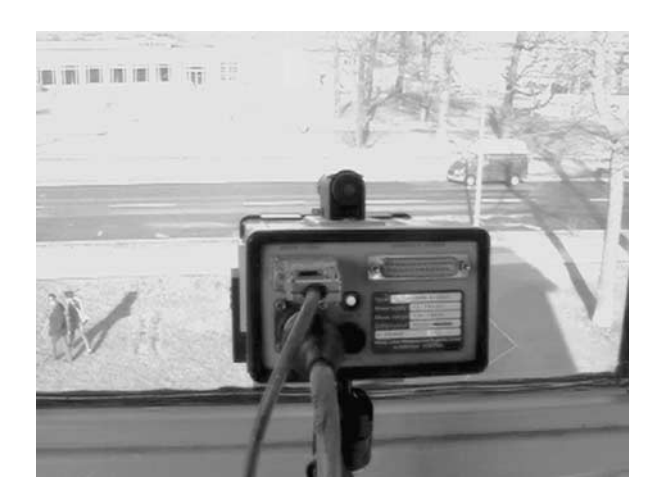
Figure 9. Laser sensor for traffic control used for sound transformations.

Due to continuous variation in the partials, however, it never remains static, at least until the video camera detects a passer-by (figures 8–10).