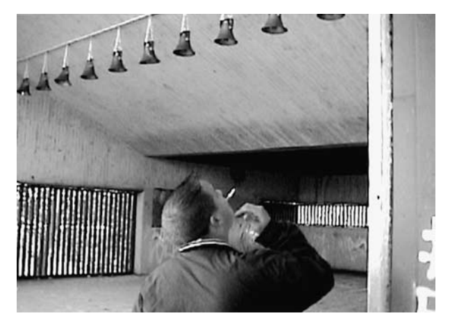
Figure 2. Site-Sound Marl Midtown. (Ortsklang Marl Mitte), visitor under the twelve horn speakers. The iron bars can be seen in the background.

The sound material was gathered entirely from this location, the train station itself. Firstly, sound was taken from the bars in the side walls (of two lengths, hence two pitches), which formed the sound background in the concrete hall by means of four loudspeakers and two subwoofers distributed throughout the space. The other sound material consisted of graffiti inscriptions from the waiting room on the train platform where the conflicts of the locale are laconically and bluntly expressed: conflicts between the right and left, foreigners and Germans, adults and youth; between declarations of love and of despair, 'no future' and sunny optimism. 'Suakraz, you're the best.' 'Sick kids. Live in their own filth. Pigs.' 'Dear Geli, dear Vanni, I hope you forgive me! I'm really crazy about you!' 'Life is hard+unjust.' 'Turks! White Power is the best thing in Marl!' 'Love is a name. Sex is a game. Forget the name and play the game.' 'Embellish the city gates with Nazi heads.' 'I hate you right-wing pigs!!! and I hate you, you left-wing wimp!'