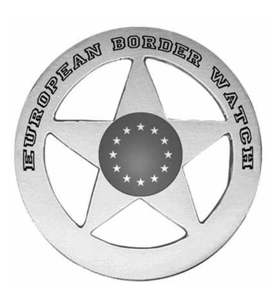
Figure 11. Logo of the fictitious European Border Watch Organisation, based on the actual Texas Border Watch Organization, which served as the model for the project towersounds.2: Watch Tower (turnlaute.2: Wachturm) in the border watchtower.