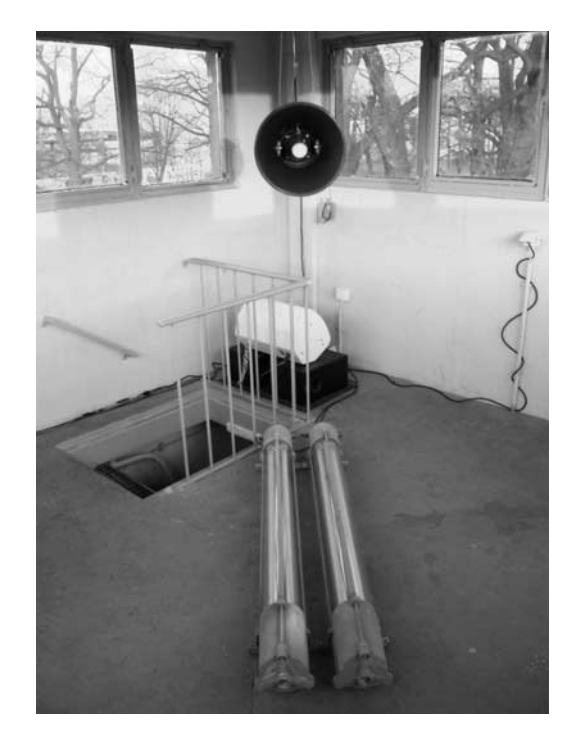
Figure 8. towersounds.2: Watch Tower (turmlaute.2: Wachturm), second floor with horn loudspeaker, green shining lamps and windows, subwoofer at the back.