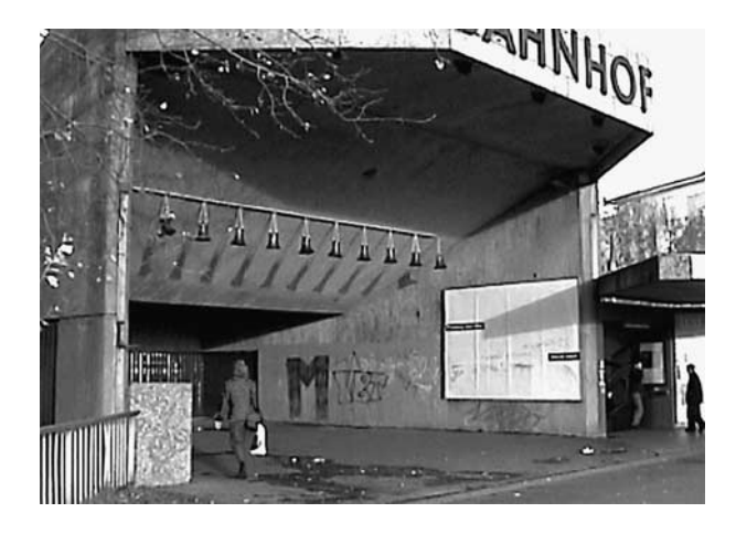
Figure 1. Site-Sound Marl Midtown. (Ortsklang Marl Mitte), sound/light installation in which visual graffiti texts at the railway station in Marl were recited as an acoustic speech choir, in combination with two electronically modified grid sounds and blue light. Georg Klein, German Sound Art Award 2002.

station in Germany's biggest industrial area, the Ruhrgebiet. The train station 'Marl Centre' is covered by a concrete hall that has no function: it does not serve as a waiting room since the people waiting are all standing on the station platform below. No train tickets are sold here and there is no information service; the hall opens in a gaping void to the southwest and consequently provides no shelter from rain, sun, wind or snow (figure 1).